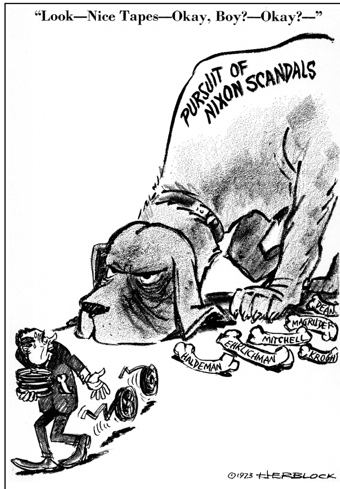
--A 1973 Herblock Cartoon, copyright by The Herb Block Foundation

Source: A cartoon by Herblock [Herbert L. Block], October 24, 1973.