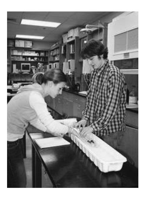
Students use an inexpensive wallpaper tray as a water bath for the cell respiration lab (AP Lab 5). When doing this lab with your students, be sure to allow the vials a full 15 minutes to stabilize. Use a thermometer in the tray to record possible temperature changes.

The AP Lab Manual gives you an idea of the types of lab exercises that should be included in an AP Biology course. Each exercise identifies pre-lab and post-lab objectives. The pre-lab objectives include the knowledge and skills students should have before performing the exercise. The post-lab objectives list what students should have learned from the exercise.