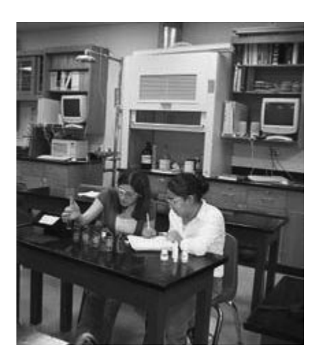
Students use the modified Winkler method to determine dissolved oxygen in AP Lab 12. The initial kit can be reused with purchased refills of chemicals.

The disposal of biohazard materials is part of the AP Biology course. Sterilization of bacterial plates and utensils before disposal is necessary. Check with your local hospital or colleges to see if they will be willing to add your relatively small amount of biohazardous waste to theirs for proper disposal. A number of supply companies sell lab safety materials, and several books and Web sites on the subject are identified in the resources section of chapter 5.